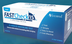
FASTCheck15™ In-Office Dental Water Test